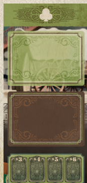
Leader Sheet Extension

During setup, place your leader sheet extension to the right of your leader sheet. This gives you 2 additional spaces to hold scoundrels (7 total), and has spaces at the bottom to hold debt tokens.