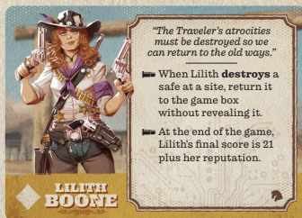
Enemy Card (normal side)

Jobs: Renegade (♫), Bookie (♣), Prisoner (♣), Treasure Hunter (♣). Traits: Mocking.