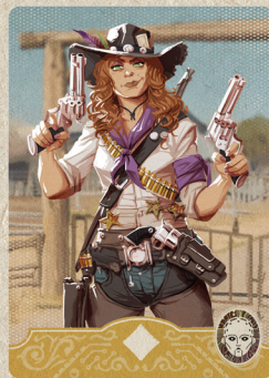
Automa Card Back

Then resolve the normal steps of setup (on the back of this rulebook). Enemies skip step 6 (they don’t start with money or other components).